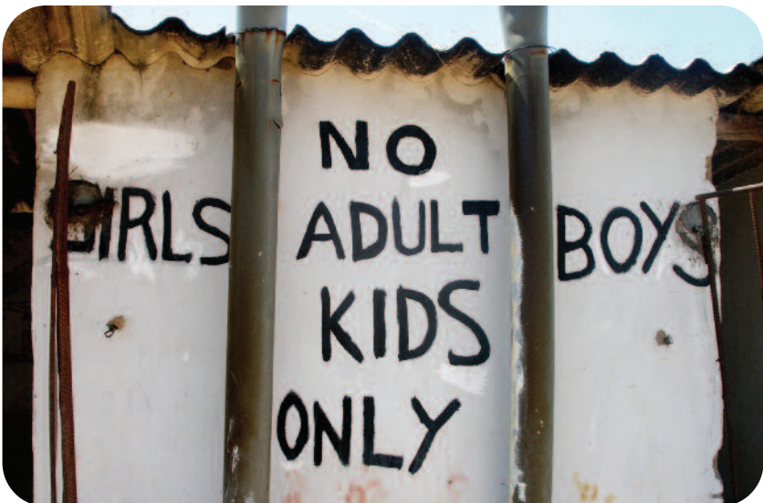
Toilets in a pre-school in Harare, Zimbabwe.