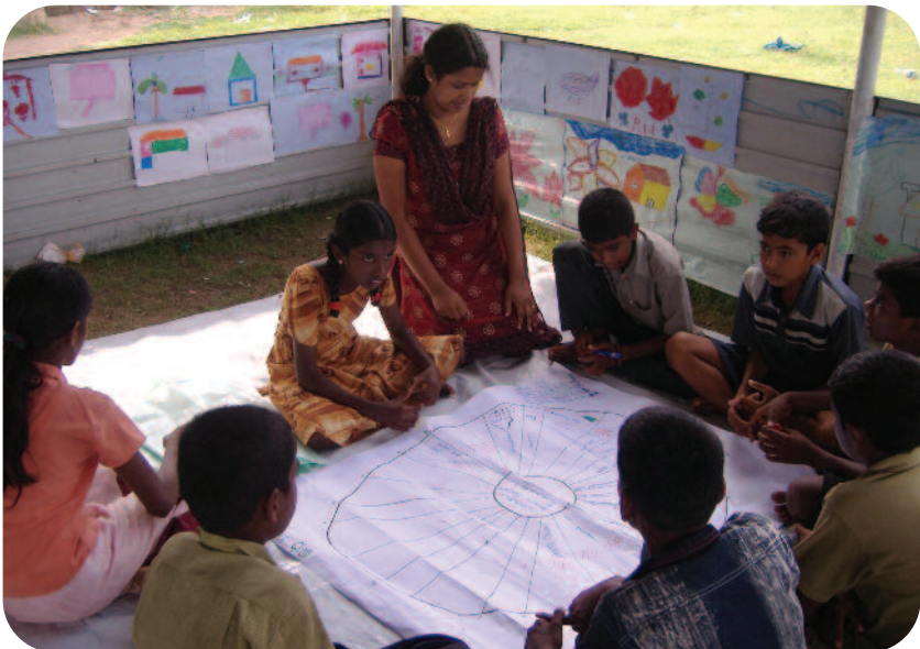
Displaced children engage in drawing activities in a temporary school in Sri Lanka.

Involving children and young people, both attending and not attending education, is vital. Discuss with them gender-related reasons for being included or excluded from accessing education. Find out what support they think is needed to help those already accessing formal and non-formal education and those not yet attending. An example activity is included in Annex 2 – The Missing Out Card can be used with learners to identify which boys and girls are unable to attend school and why.