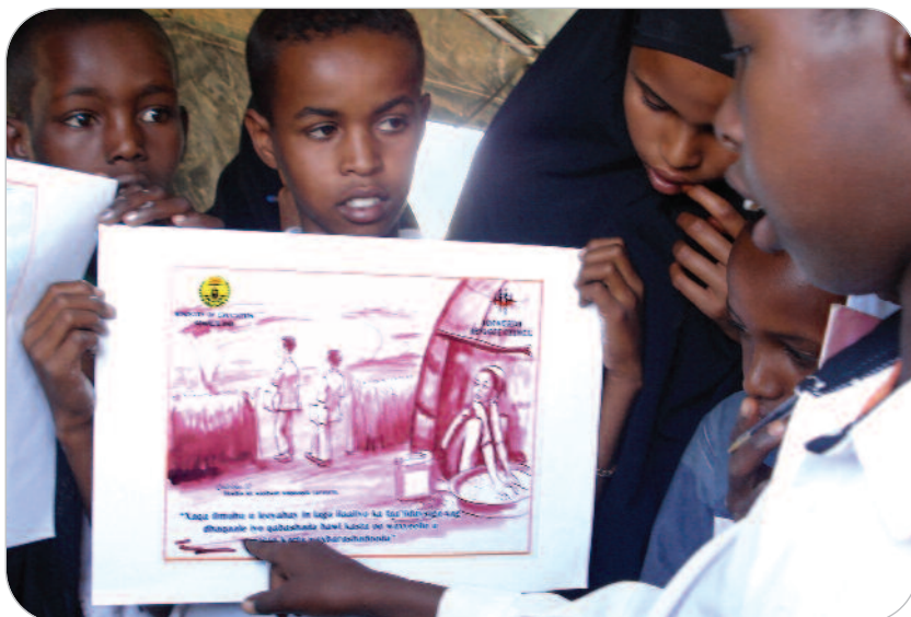
Learners discussing the right to education for all - the quote on the poster is from the Convention on the Rights of the Child.